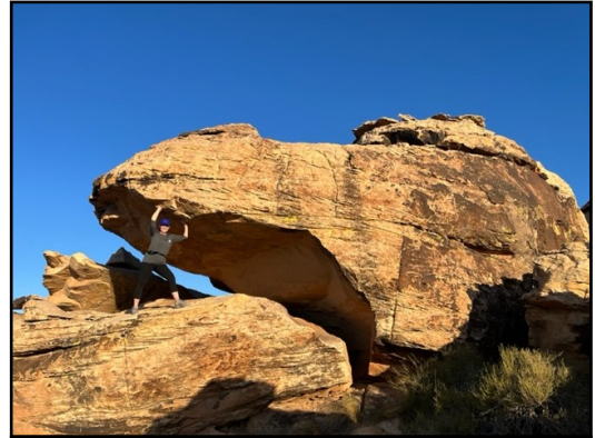
Holding up the rock during one of my hikes at the Movara Resort in beautiful St. George, Utah.