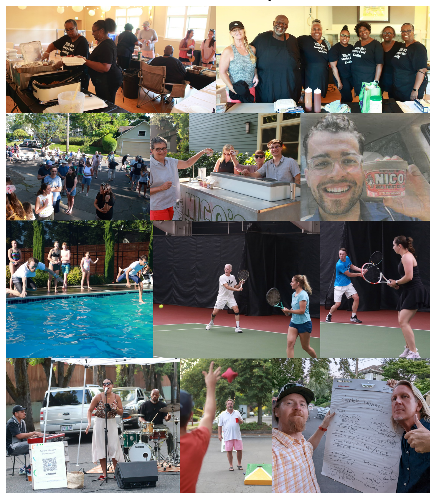
To view all the pictures, go to the following link: <a href="https://photos.app.goo.gl/HYSKvJCc1Z1t1Z2V7">https://photos.app.goo.gl/HYSKvJCc1Z1t1Z2V7</a>

Thanks to Soren Coughlin-Glaser for the great pics! And a shout out to Soren and Brian Schaeperkoetter for organizing and winning the cornhole tournament as a team.